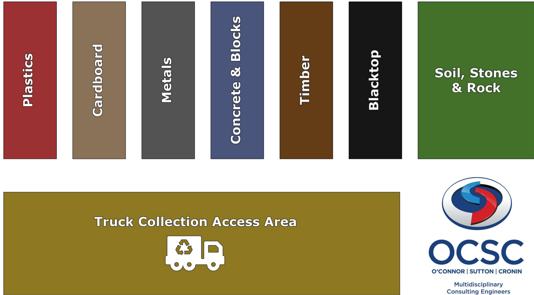
Figure 3: Proposed C&D Waste Storage Area (Scale: NTS)