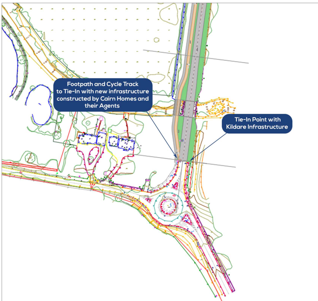
Figure 2: MOOR Eastern Kildare Tie-In

The MOOR will be a single carriageway road connecting the Maynooth environs between the east and west. On the eastern side, the road will tie in in Kildare County, just north of the roundabout on the R157. A separate cycle and pedestrian bridge will be constructed alongside the existing bridge to allow for continuation of this infrastructure, tying in with existing infrastructure in Kildare County. This can be seen in the figure below.